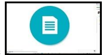
Collab. Google doc