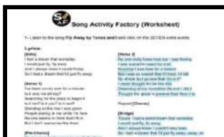
VIDEO (Interactive worksheets) LYRICS